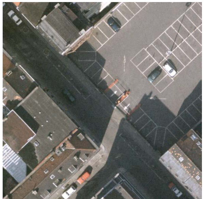
CLEANED IMAGE – NO DUST & SCRATCHES

The image is scanned twice – once with RGB light and once with IR light. The IR image is used to detect exactly where and what is foreign from the original image. Software then utilizes surrounding image information to remove the foreign matter from the original RGB image.