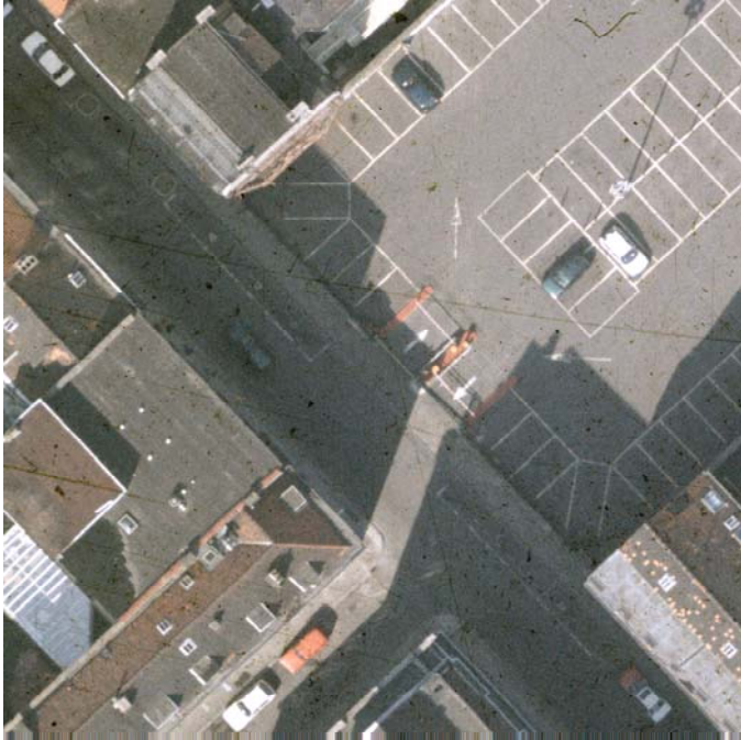
Image with dust and scratches